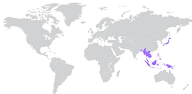
SOUTHEAST ASIA AND JAPAN