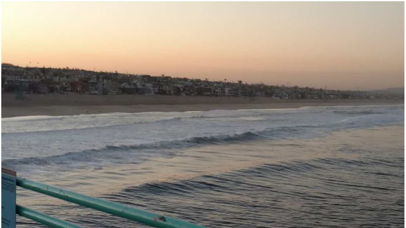
Pacific Ocean - Manhattan Beach - California USA April 2017