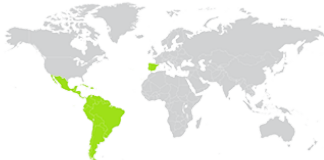
IBEROAMERICA AND THE CARIBBEAN