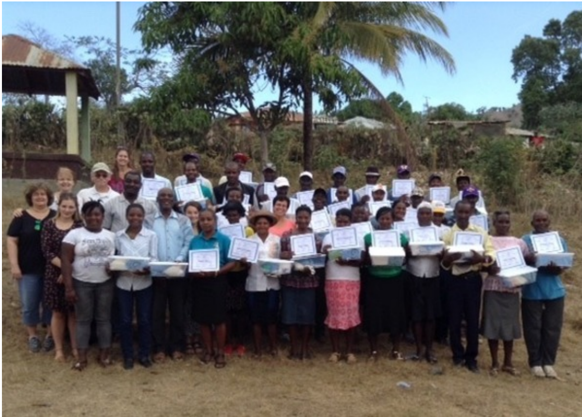
Graduates and CHE Staff Trainers