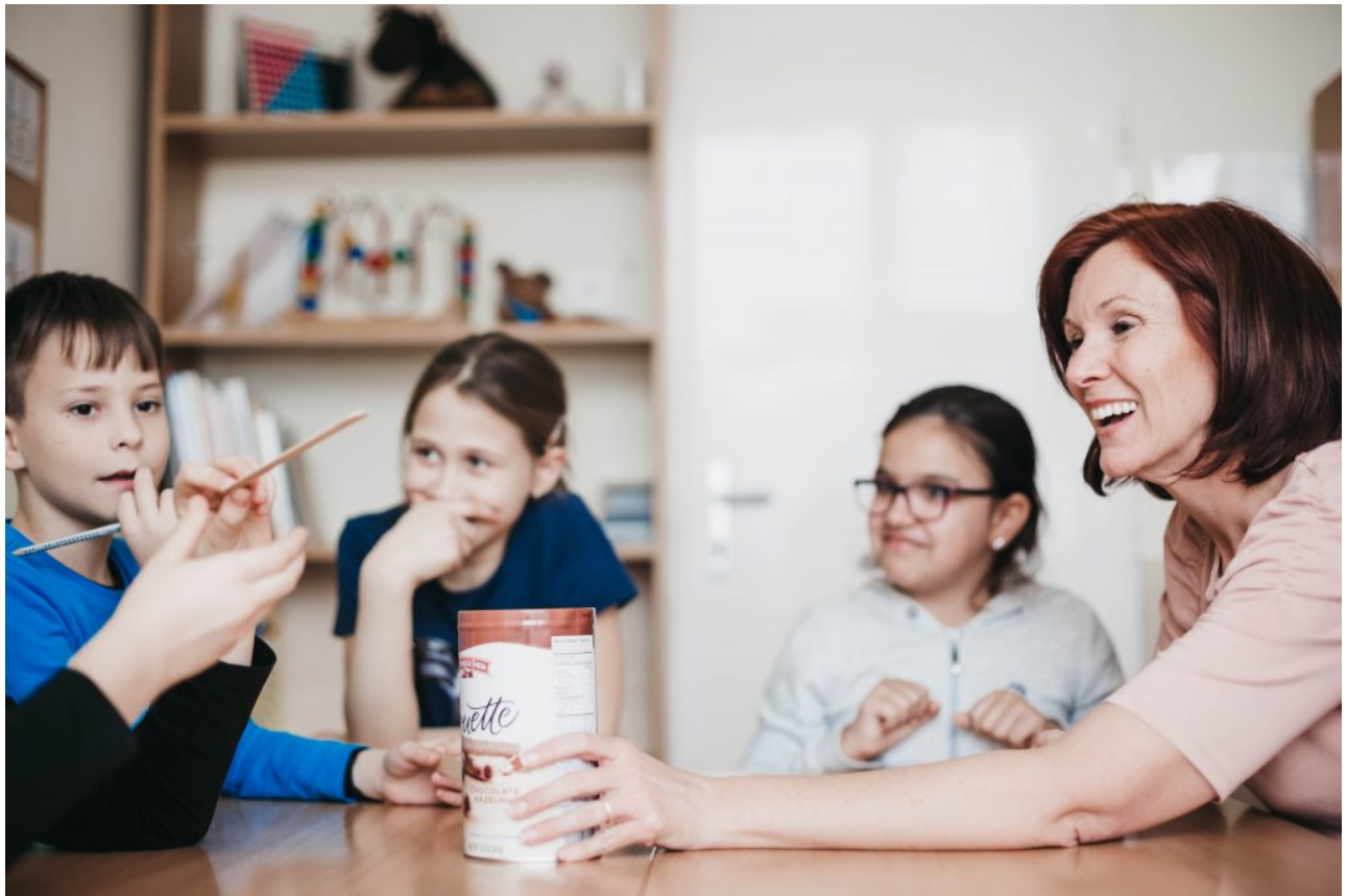
Another special event we enjoy every spring is Farsang! Farsang is the special dress party for children in Hungary.