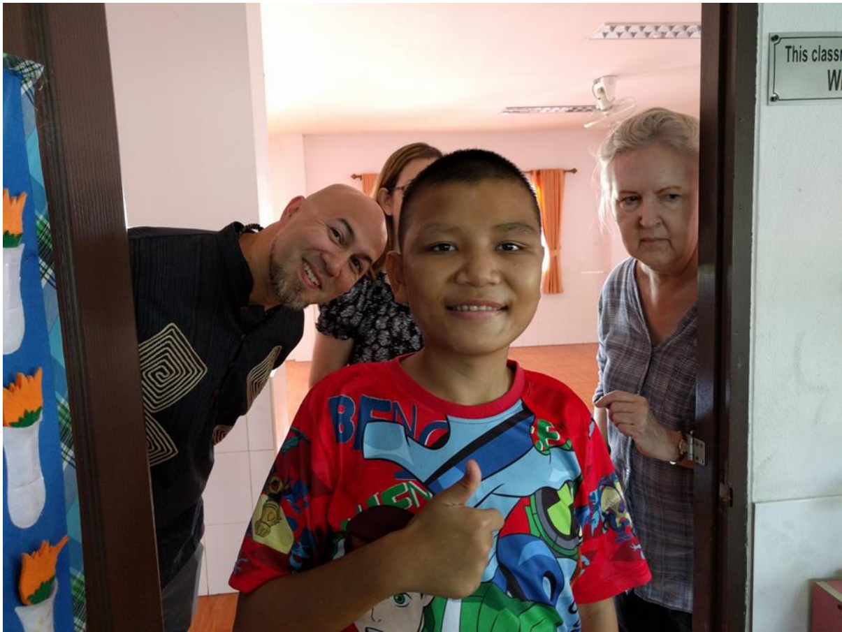
Sutee at House of Love, October 2016