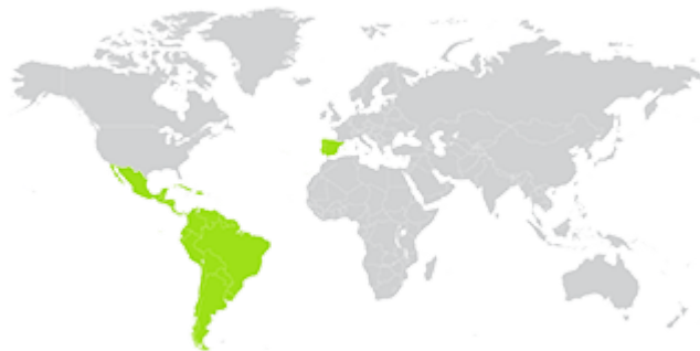
IBEROAMERICA AND THE CARIBBEAN