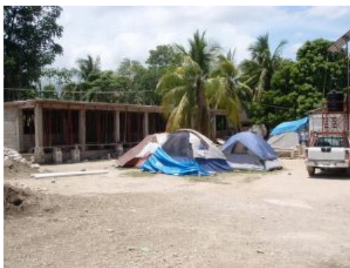
Servant Leaders' Meeting – Grand Goave – Grand Goave