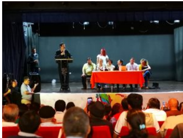
Manuel Zelaya en el Foro Mesoamericano