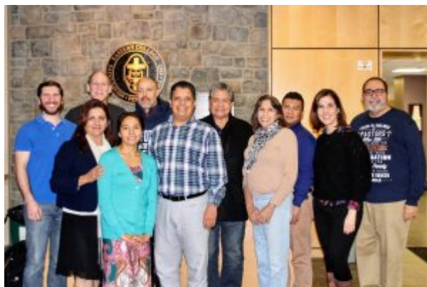
Latino/a Pastors in the U.S. 2 Cohort