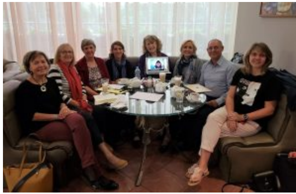
European Baptist Federation Anti-human Trafficking Working Group