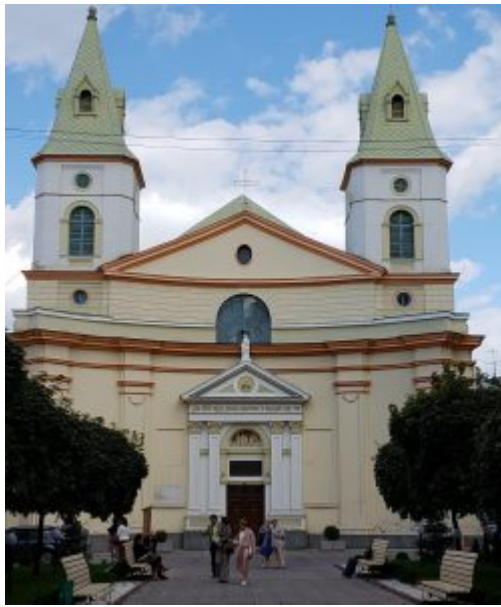
Central Baptist Church in Lviv, Ukraine