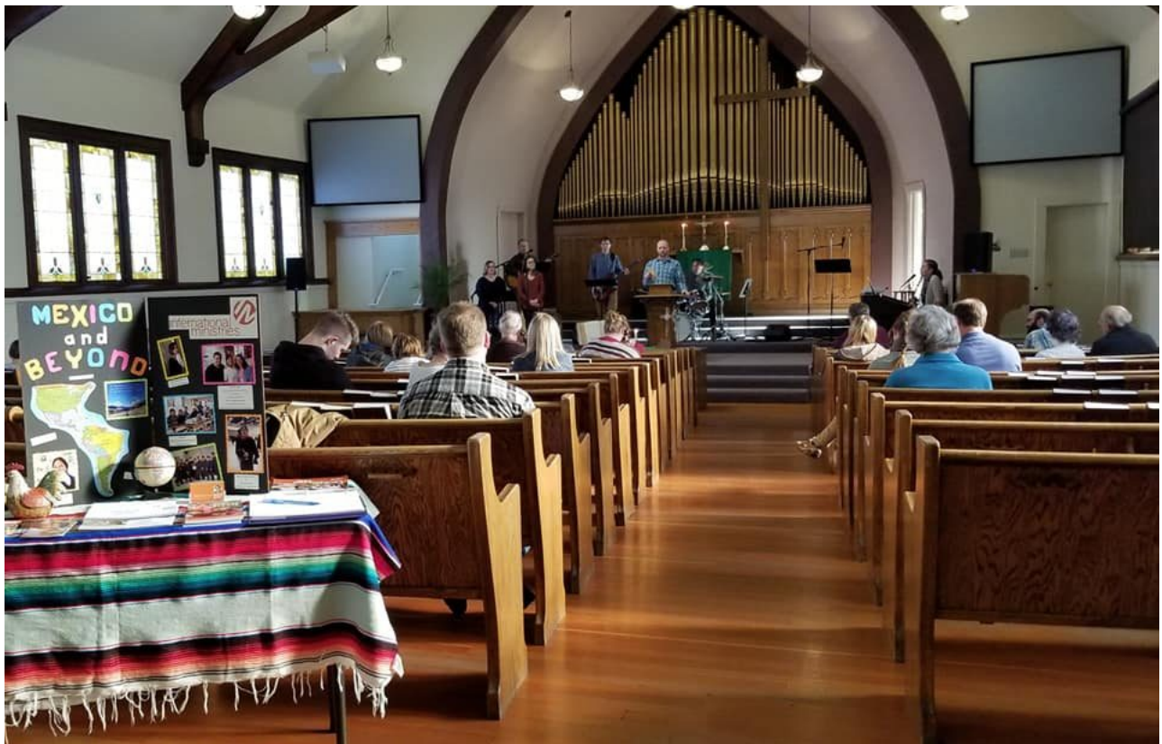
Photo was taken during a visit at First Baptist Church – Bozeman, MT