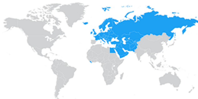
EUROPE, THE MIDDLE EAST AND LIBERIA