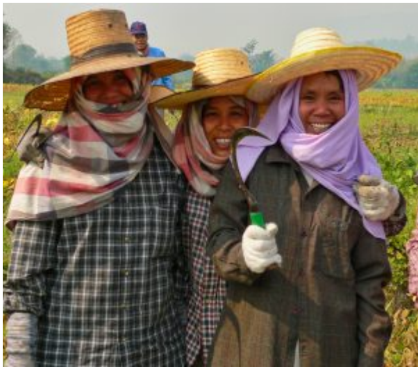
Harvest time in Ban Luang, Thailand.

When they called, we talked for over an hour—and might have gone on much longer! We shared things we are all learning about working effectively with Scripture and with people. The excitement—on both sides of the call—was clear. So was the joy! They are, in many ways, at about the same place on the journey that Cathy and I were, 39 years ago (right down to the baby-on-the-way!). What a privilege, to be able to encourage fellow servants of Christ!