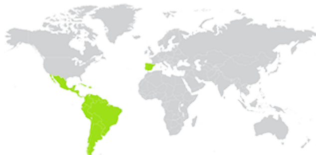
IBEROAMERICA AND THE CARIBBEAN