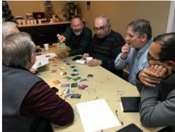
Small Group Sharing

God is expanding our ministry with IM as we begin to offer spiritual care during regional missionary retreats for our colleagues. In January, we joined missionaries from Latin America at Palomar Christian Conference Center for fellowship and spiritual renewal. Each day we facilitated a time for nurturing and deepening our relationship with God.