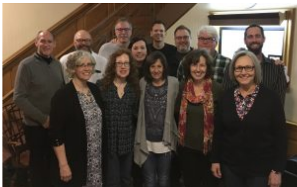
Evangelical Mission Agency Round Table Gathering for Spiritual Care