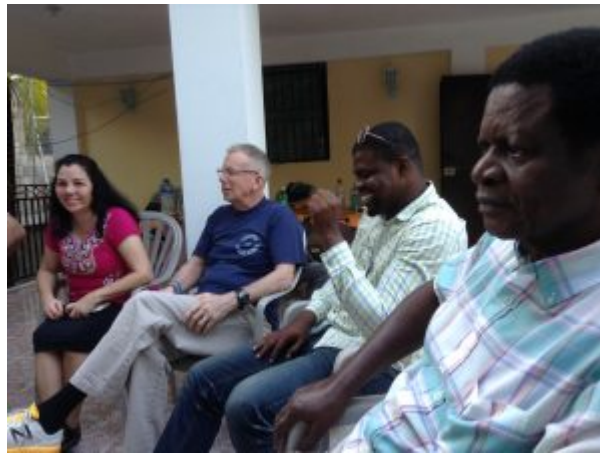
Meeting with different leaders