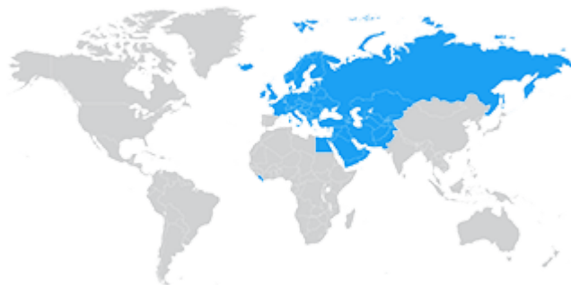
EUROPE, THE MIDDLE EAST AND LIBERIA