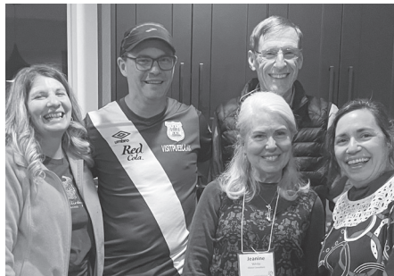
IM's annual conference for global servants.

“Many could look at the life of a global servant, especially after reading a ministry update or hearing them speak and think, ‘they’re spiritual giants going from victory to victory.’ They’d never guess that we may be barely hanging on. Whether a global servant enjoys success or failure, acceptance or rejection in a cross-cultural mission context, sooner or later they will find themselves in a wilderness. Having