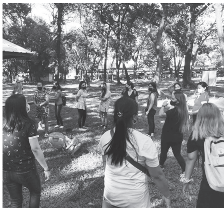
Women from the street enjoy games led by Samaritana staff at a public park in December 2021.