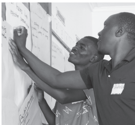
Peacebuilding and community development participants practice facilitating a workshop.