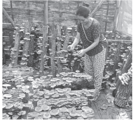
A woman harvests mushroom cultivation.

Through funds raised by IM, fifteen of the participants received a small grant to assist in the startup of projects they developed through the course. Designed to generate employment and meet the needs of their communities, these enterprises include piggeries, fisheries and study dorms for students. Mushroom cultivation and marketing have improved the lives of many villagers while supplying market needs. There is even a major endeavor underway to organize co-ops in several villages to supply tapioca for a new factory that is creating