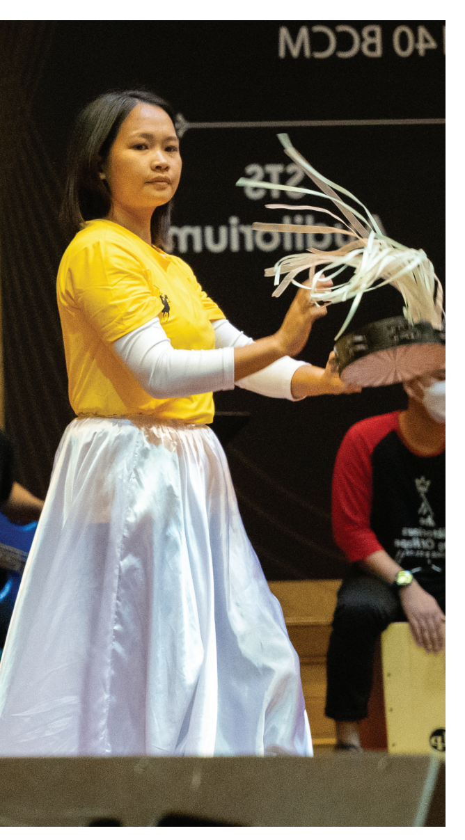
Student at Sabah Theological Seminary, Malaysia