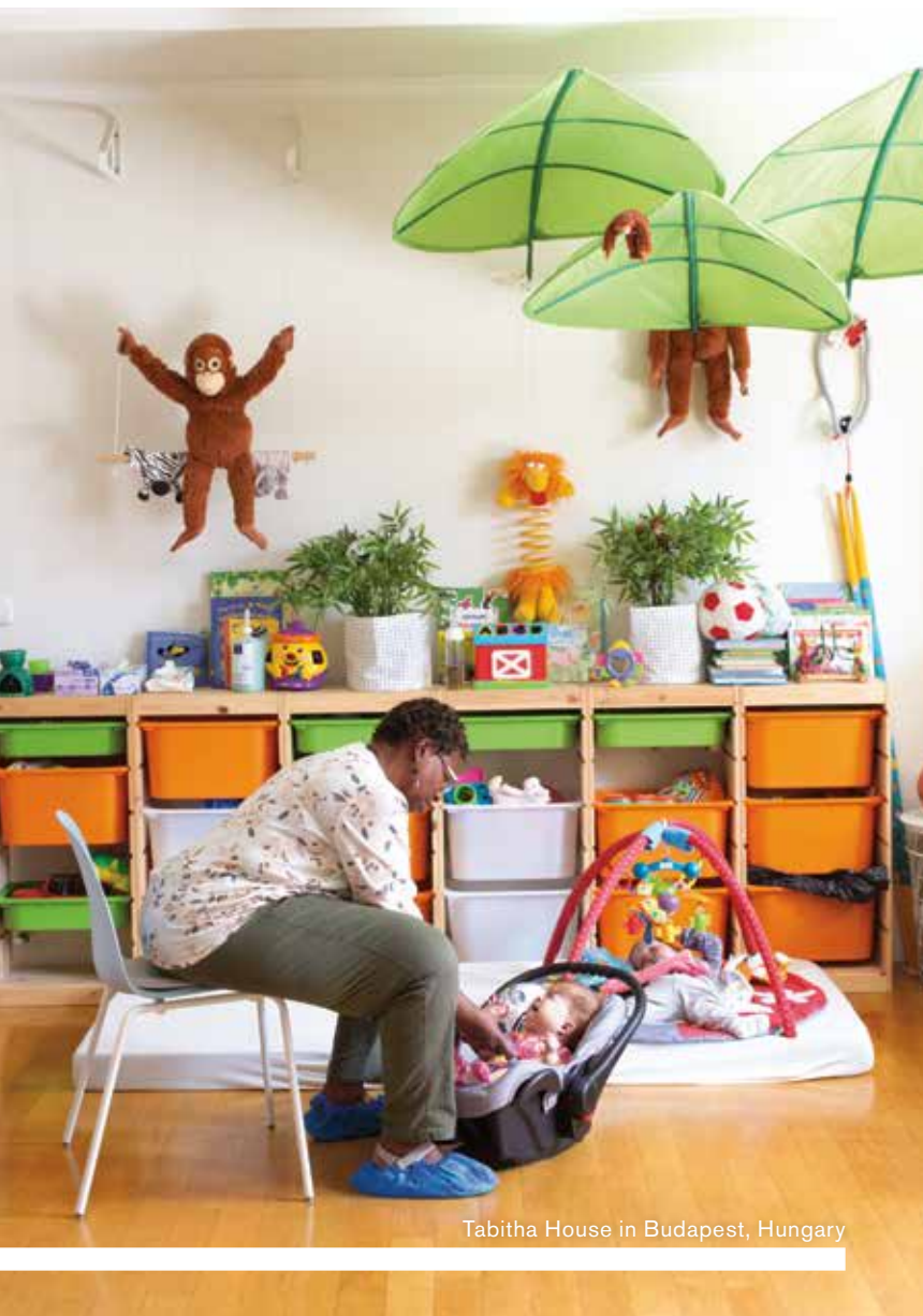
Tabitha House in Budapest, Hungary