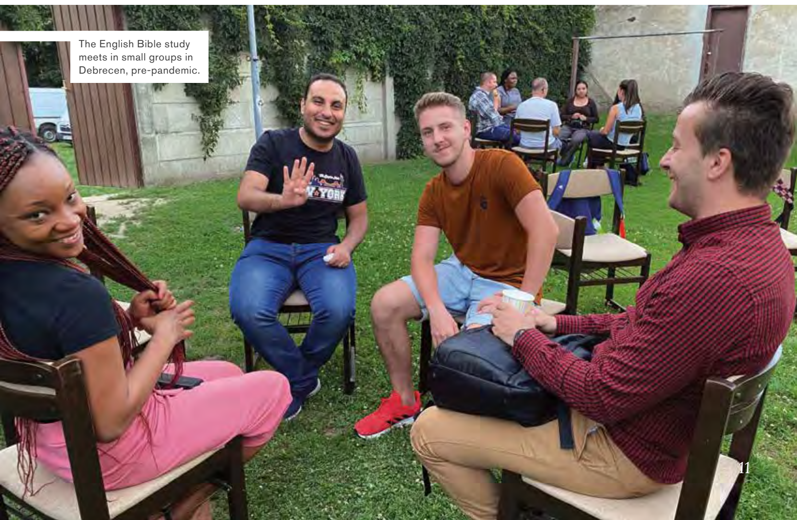
The English Bible study meets in small groups in Debrecen, pre-pandemic.