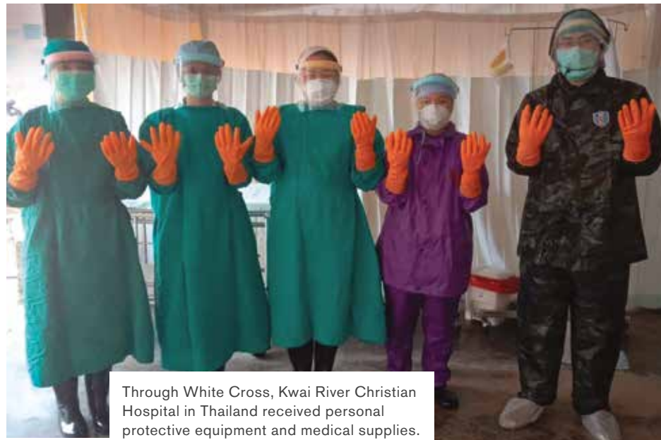
Through White Cross, Kwai River Christian Hospital in Thailand received personal protective equipment and medical supplies.